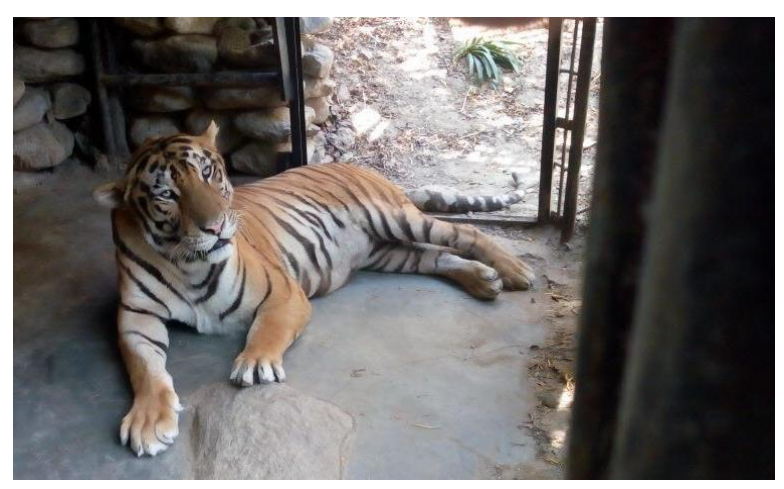
Tiger in a cage in the private zoo at "Hope for Life"

The areas where the children live differ substantially. Seventy-two children without disabilities live in the "Transformation Village," consisting of nine houses. Each house has two small rooms where 8 children sleep. The houses have a small living room but are not air conditioned. Children spent most of the day outside as the buildings were very hot.