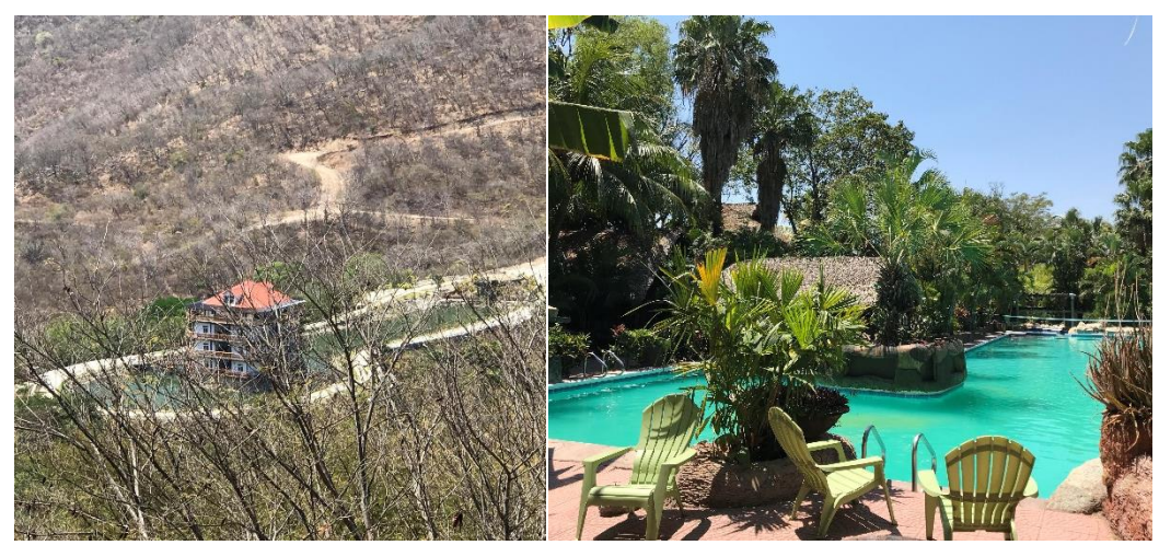
Left: Hotel for volunteers with artifical lake; Right: pool for volunteers