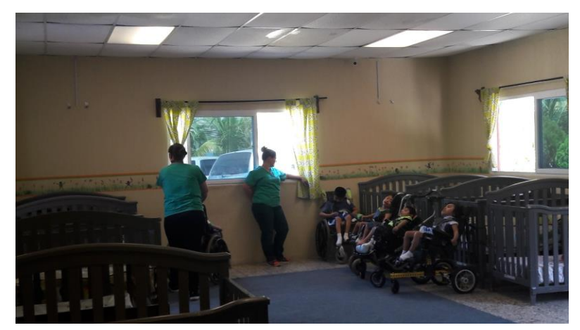
Survivors of Hogar Seguro at Hope of Life

At Dorie's Promise, a private institution, staff is not involved with the children; during our visit they were engaged in other activities such as cooking and washing clothes. There were volunteers at the institution who expressed that the staff often looked "exhausted."<sup>59</sup> In this facility, DRI found two children with disabilities. When we arrived at the institution we found one of them locked in a room by himself. The two children with disabilities did not participate in the activities that the staff and volunteers organized for the rest of the children, including attending school. At Hope for Home, DRI found two staff caring for 11 children in one house. The house was in an abandoned state, there were dirty clothes on the table, the rooms were not clean, and the house was not fully accessible.