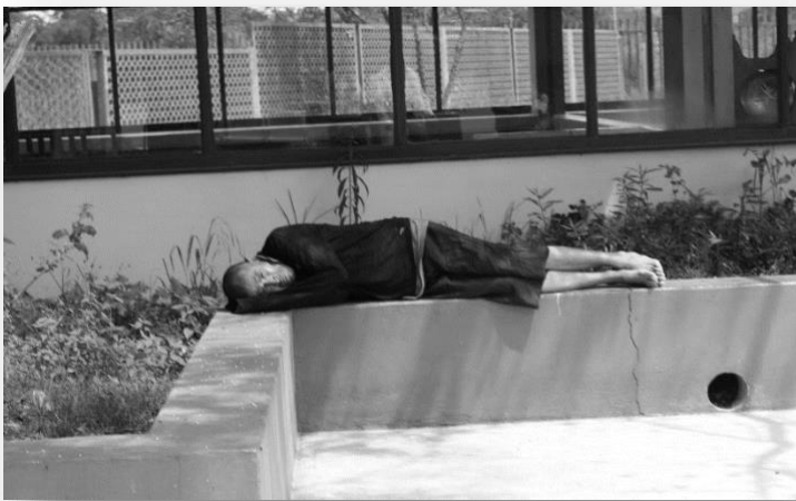
"El Batán," Puebla, 2019