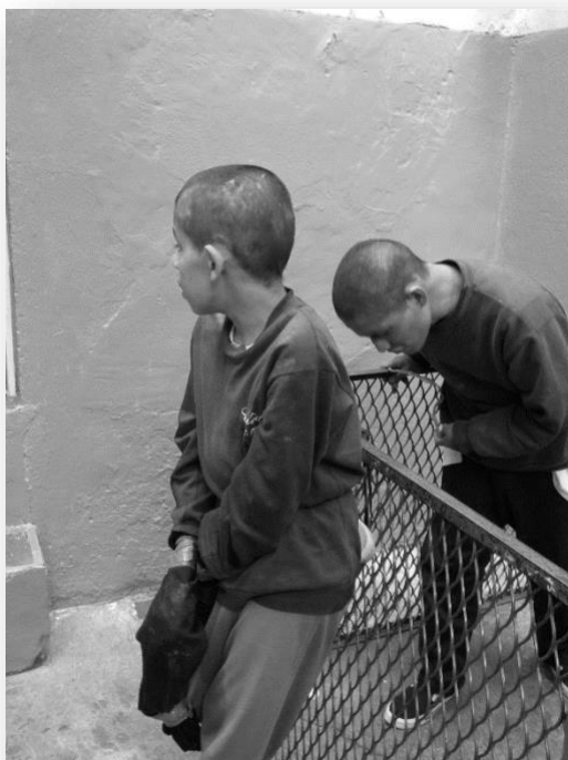
Casa Esperanza, Mexico City, 2015