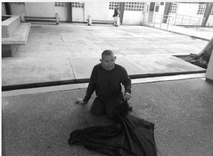
Psychiatric facility, State of Mexico, 2019

Mexico continues to institutionalize persons with disabilities indefinitely, in defiance of the CRPD Committee's call to urgently adopt a deinstitutionalization policy and in violation of Article 19 of the CRPD. Authorities throughout Mexico reported that the main reason for placing people in institutions is the lack of community-based alternatives to support independent living, including for children (see Section on Article 23).