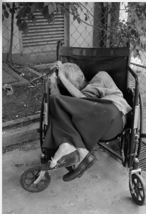
CAIS Villa Mujeres, Mexico City, 2016