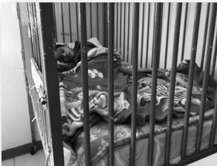
Casa Gabriel, Baja California, 2019

“Missing documentation in the files of the staff, outdated database, bad grooming of children, lack of physical therapy [...]. Need to increase the weight of the children, carry out a cognitive assessment of the children. Need to fill out adequately the voluntary admission paperwork in order to have as much information as possible on the relatives who place the children here.” 221