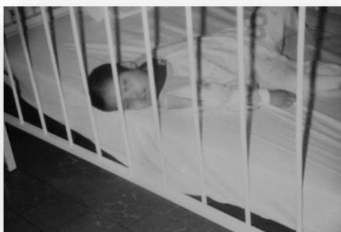
Casa de la Consolación de los Niños Incurables, Mexico City, 2000