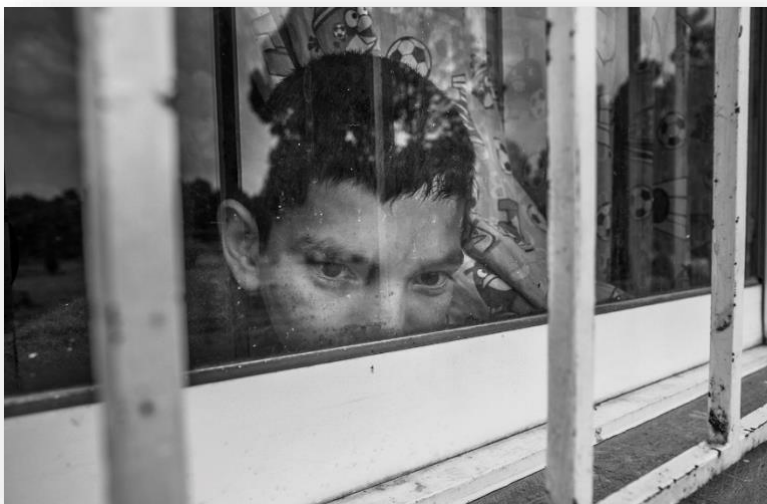
Casa Hogar and Centro de Discapacitados Amecameca, State of Mexico, 2018

In every single institution visited by DRI, investigators observed children who had been detained there due to poverty-related factors. In the case of Casa Esperanza in Mexico City, most of the people detained there were separated from their families when they were children, mainly due to disability or poverty. 302 María's (not her real name) case exemplifies this situation. The DIF Aguascalientes separated María from her mother when she was 14 years old, 303 because her mother was considered too poor to care for her. 304 María grew up in Aguascalientes, but DIF took her to an institution named Casa Hogar San Pablo, in another state. María became depressed, attempted suicide, and was subsequently transferred to a psychiatric institution. 305 Shortly afterwards, she was sent to Casa Esperanza, 306 where she suffered physical and sexual abuse. Because of the abuse she suffered, she has had several crises which have not been properly treated. Instead, she has been transferred from institution to institution, re-traumatizing and re-victimizing her.