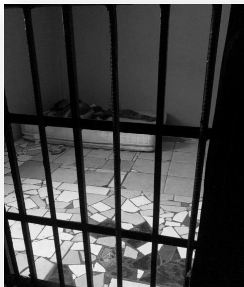
CRREAD Cañón Rosarito, Baja California,

At the Baja California Psychiatric Institute, DRI found a 68-year-old man with an intellectual disability who had been in an isolation room for more than four months because he “ate dirt and paper.” 109 At the same institution, DRI found a pregnant woman in an isolation room; she told DRI, “I am afraid of staying here.” This institution had 10 isolation rooms, five for men and five for women. The reason and duration for placement in isolation varied from person to person. A nurse told DRI that people could be isolated “from three to five days. but if they are in very bad conditions, it could be weeks.” 110 The director claimed that people in isolation can come and go freely; however, DRI observed that they were locked and the persons who were in them had to ask for permission to go out.