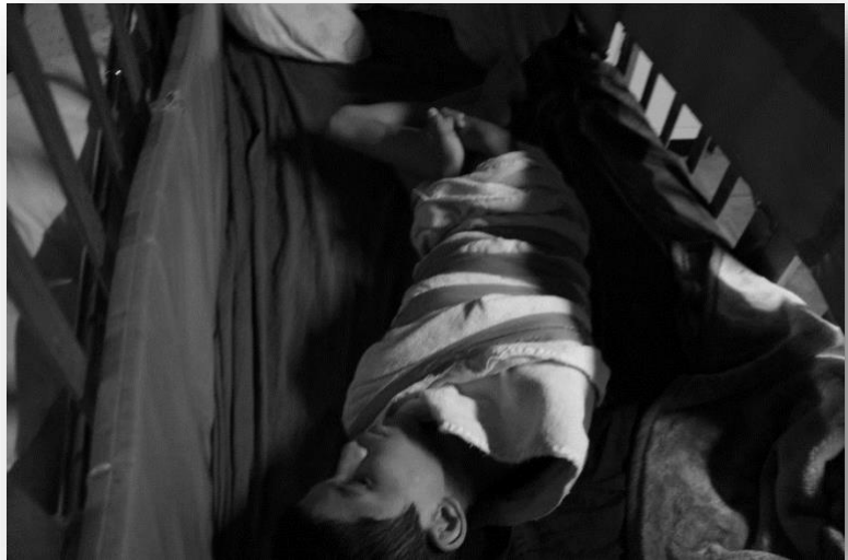
Hogares de la Caridad, Jalisco, 2018