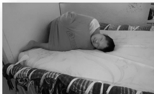
Casa de la Consolación de los Niños Incurables, Mexico City, 2015