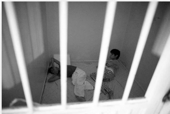
Casa Hogar San Pablo, Querétaro, 2018