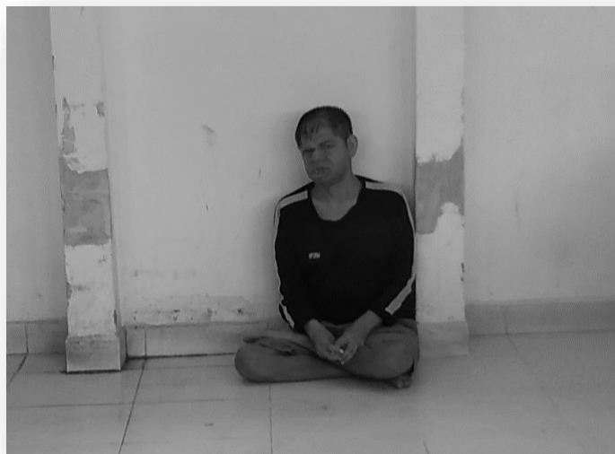
Samuel Ramirez facility, State of Mexico, 2019

It has been twenty years since DRI first brought the abuses in Mexican institutions to world attention 22 – and more than ten years since the CRPD entered into force. Mexico was a leader in calling for the United Nations to draft the CRPD, yet it has not applied the most fundamental protections of this convention to its own citizens with disabilities who are confined to institutions. A higher degree of accountability is needed than Mexico has already received from the CRPD Committee and the Inter-American Commission on Human Rights. The lives of thousands of children and adults with disabilities depend on it.