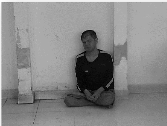
Samuel Ramirez facility, State of Mexico, 2019

According to an official from the Ministry of Health's Psychiatric Services (SAP by its acronym in Spanish), "80% of hospitalizations are involuntary." 60 Similarly, staff from the Yucatan Psychiatric Hospital told DRI that "most of the time, hospitalization is involuntary." Given the lack of alternatives in the community (see Section on Article 19, right to community integration), hospitalizations in psychiatric facilities lead to indefinite institutionalization if the person has no supports or family in the community.