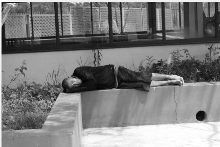
“El Batán,” Puebla, 2019

detained a girl who was diagnosed with schizophrenia; however, “they do not specialize in psychosocial disabilities,” 336 so they sent the girl back to her family.